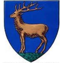
Consiliul Județean Gorj