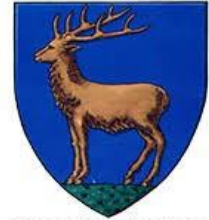
Consiliul Județean Gorj